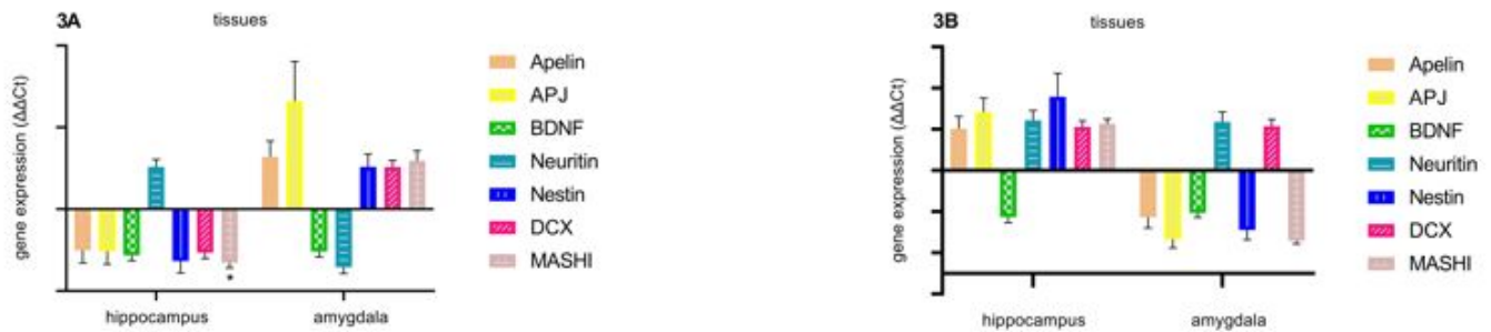
Figure 3. Effect of apelin administration on gene expression levels. A: Gene expression levels of Apelin, APJ, BDNF, Neuritin, Nestin, DCX and MASH1 in the hippocampus. After the SI, B: Gene expression levels of Apelin, APJ, BDNF, Neuritin, Nestin, DCX and MASH1 in the hippocampus. After the apelin administration. All data were expressed as mean \pm SE values and analyzed by one-way factorial ANOVA with Tukey post-hoc test. There is no significant difference between the groups ( p > 0.05 ).

gel electrophoresis methods. mRNA-level expression of the candidate and reference genes was detected by qRZR. PZR products of all genes were observed in the agarose gel (2%) electrophoresis.