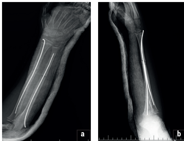
Figure 2. (2a-2b) a 10-year-old male was operated with closed reduction and elastic nail method

In the elastic nail surgery technique, after closed reduction was performed in the distal radius or proximal ulna, elastic nails were sent antegrade or retrograde. The ends of elastic nails were left under the skin and the wounds were sutured. If closed reduction was not achieved, open reduction was performed. Nails with a diameter of 1.5 mm to 2.5 mm were used depending on the age of the patients and the bone medulla thickness (Figure 2a-2b).