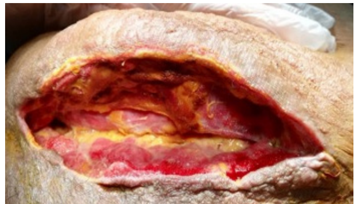
Figure 2. The appearance of the wound on the 6th day after the operation