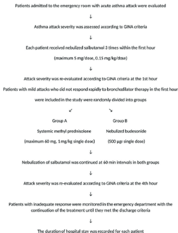
Figure 1. Flow chart of the study

treatment: 0.25 \pm 0.51 ) ( p < 0.001 ) (Table 1). There was no statistically significant difference between the groups in terms of duration of hospital stay (5.23 hours in Group A, 4.81 hours in Group B; P > 0.05 ) (Table 1).