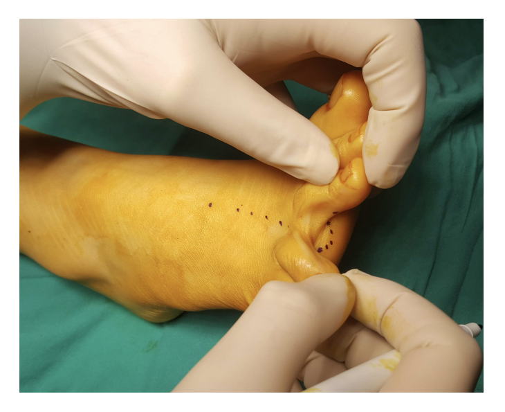
Figure 2. Incision over the 3th web space between metatarsal heads.