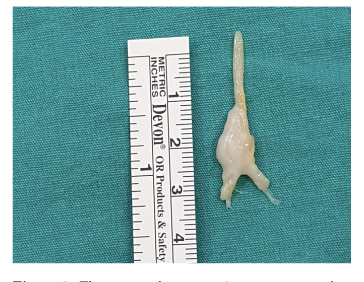
Figure 6. The nerve and neuroma tissue appearance that were excised in a manner that included 1 cm distal and approximately 2 cm proximal to the intact portion of the common digital nerve, along with the neuroma tissue, in a single piece.

Table 1. Scores used in the evaluation of patients.