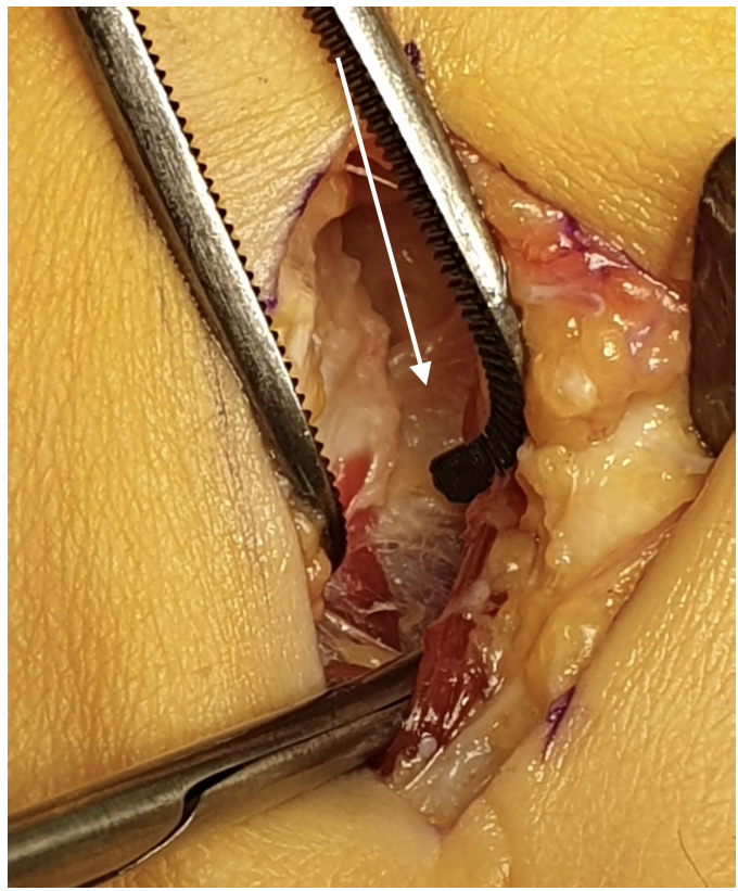
Figure 3. Appearance of the transverse ligament the between 2 and 3 intermetatarsal heads (arrow). The retractor (or clamp) facilitates exposure.