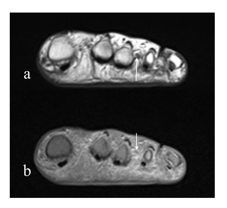
Figure 1. T1(a) and T2(b) MRI images of Morton's neuroma (arrow) in the third web space of a 56-year-old male patient.

Our study is a retrospective study involving 16 patients with a confirmed diagnosis of MN based on pathology, who presented with complaints of pain and paresthesia in the forefoot and were surgically treated at the orthopedics and traumatology outpatient clinic of Inonu University. The study was approved by the Inonu University Ethics Committee (2024/5912). Patients with complete medical records, regular follow-ups, and surgical treatment for MN were included in the study. Patients with incomplete medical records, irregular follow-ups, or a post-surgery change