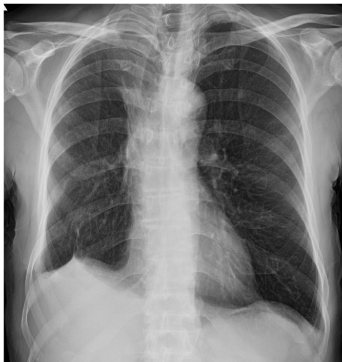
Figure 3. Postoperative 15 month chest radiography.

the same port. Minimal adhesions were separated by sharp and blunt dissection with the help of energy devices, and the parenchyma was freed. First, the right upper lobe pulmonary arteries and superior pulmonary vein were dissected and cut. The incomplete fissure was opened with an endostapler. The main bronchus was divided until the intermediate bronchus. The main and intermediate bronchus were cut with the help of an endoscissor with appropriate surgical margins, and the lobectomy material was removed. Both macroscopic appearance and frozen