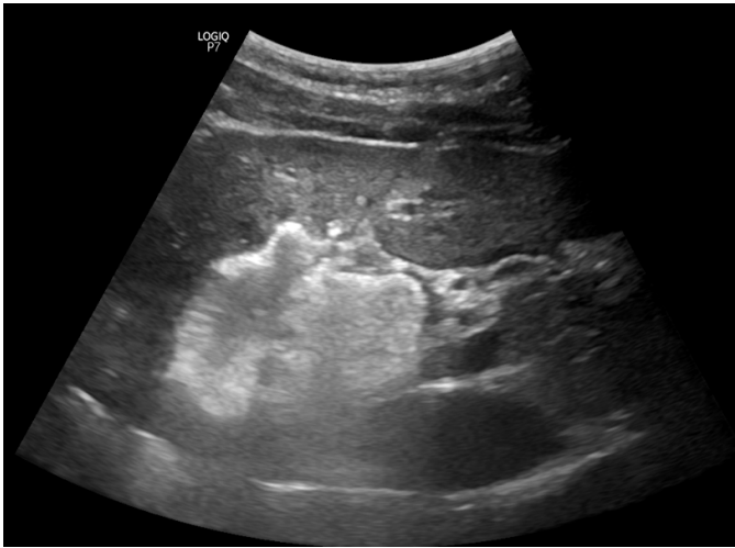
Figure 3. Injection of hypertonic saline.