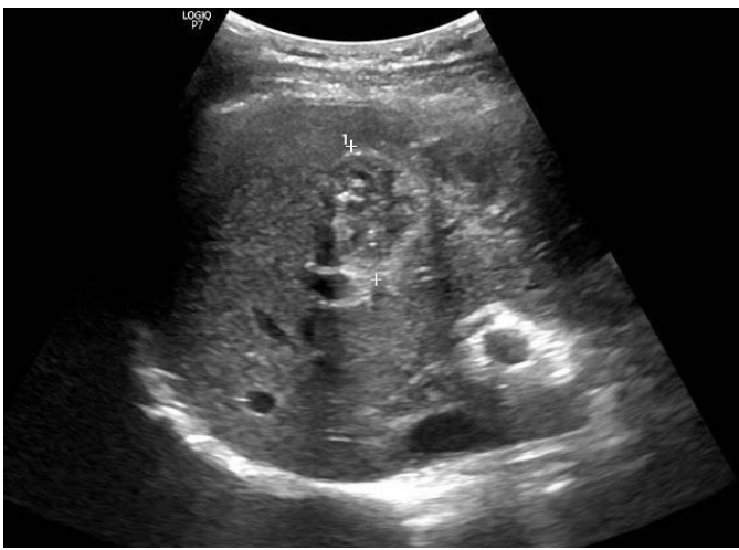
Figure 4. Cystic inactivation and pseudotumor appearance.

aspiration and PAIR was terminated (Figure 1, 2, 3) [14].