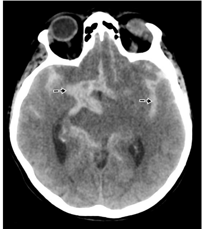
Figure 1. Subarachnoid hemorrhage secondary to intracranial aneurysm on CT image.

CTA of one patient, brain MRI of 40 patients, brain CT of 4 patients and DSA examinations of 4 patients were determined (Table 1). Aneurysm was detected in 7 patients; there were multiple aneurysms in 2 patients. Subarachnoid hemorrhage was detected in 2 patients, one of which was treated endovascularly and one of which was treated surgically (Figure 1) (Table 2). 2 Common carotid artery, 2 anterior communicating artery, 4 middle cerebral artery and 1 anterior cerebral artery aneurysms were detected (Figure 2 and 3). Aneurysm sizes ranged from 1.5 to 8 mm. There was near perfect agreement among the observers ( \kappa=0.892 ).