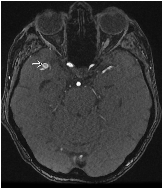
Figure 2. MRA image showing multiple aneurysms in ICA and ACA.