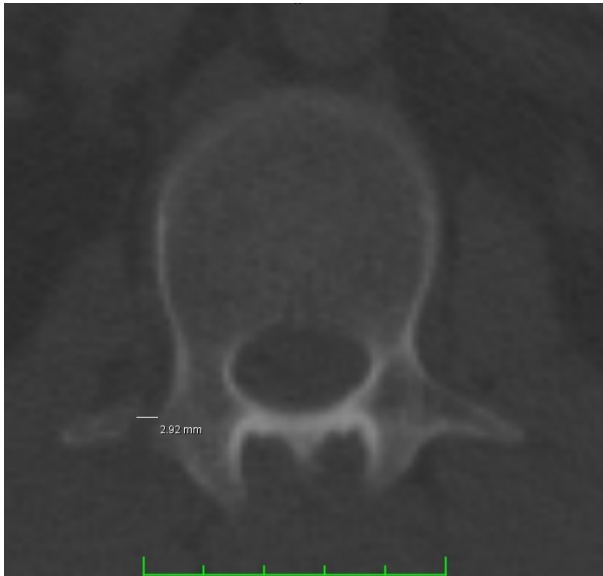
Figure 1. Right T12 TPF (axial section)