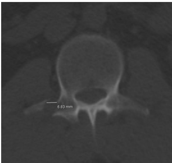
Figure 2. Right L2 TPF (axial section)

not be accessed in the radiological report system, who had multiple injuries, having a diagnosis of neoplastic or a previous pathological fracture, were under the age of 18 were excluded from the study.