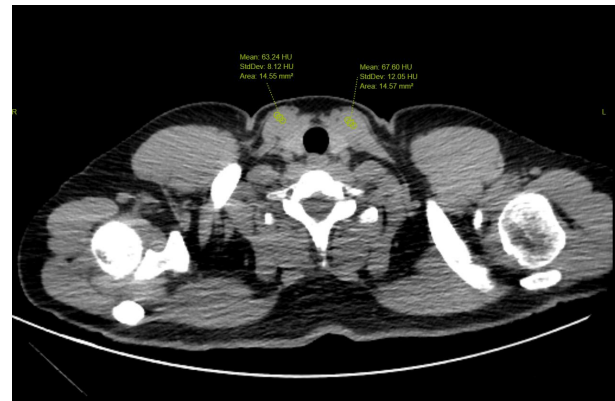
Figure 1. Measurements of SCM muscle (a) and trapezius muscle (b) densities are shown on axial Thorax CT images adjusted to the mediastinal window.

The analysis of the images was carried out using the DICOM viewer (FONET, v4.1, Ankara, TR) of the PACS system integrated into HIS. The densities of the right and left SCM and trapezius muscles of all participants were measured by an 8-year experienced radiologist (P.G.B.) on axial thoracic CT images, where they are best seen at the level of the thyroid gland. The muscle densities in the axial sections were evaluated as the average of three