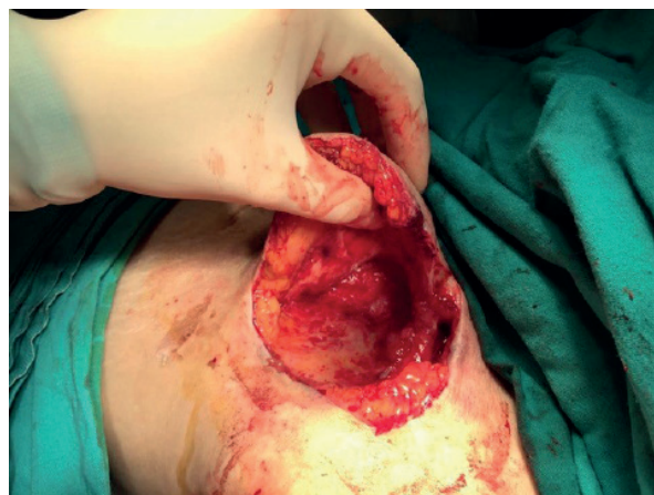
Figure 4. Monitoring of capsule image during pocket change