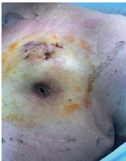
Figure 2. Minimal necrosis due to the possible pressure of the generator section

The appearance patterns can range from slight thinning of ordinary skin, epidermolysis and erosion to clinical pictures such as exposition of electrical pulse generators and lead connections, skin necrosis and capsule contraction (Figure 2). Naturally, types of treatment can range from only superficial debridement, to irrigation of the pocket, replacing the pocket and preparing another pocket for the battery, primary reconstruction of skin defect, Z plasty, local flaps and muscle flaps. If effective control cannot be achieved after infection of generator and connections placed normally in infraclavicular pockets, it could sometimes become necessary in battery