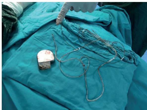
Figure 3. All the exposition generators and wires replaced and surgically placed on the table