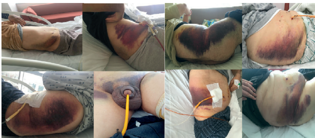
Figure 2. Echimoses observed at skin of abdominal wall, scrotum and legs

None of the patients had active drainage from the abdominal drainage catheter. The mean drain removal time was 3 (2-6) day. The areas of ecchymosis were observed as completely disappeared in all patients at routine postoperative 1st month control visit. Surgical exploration was not needed for any patient.