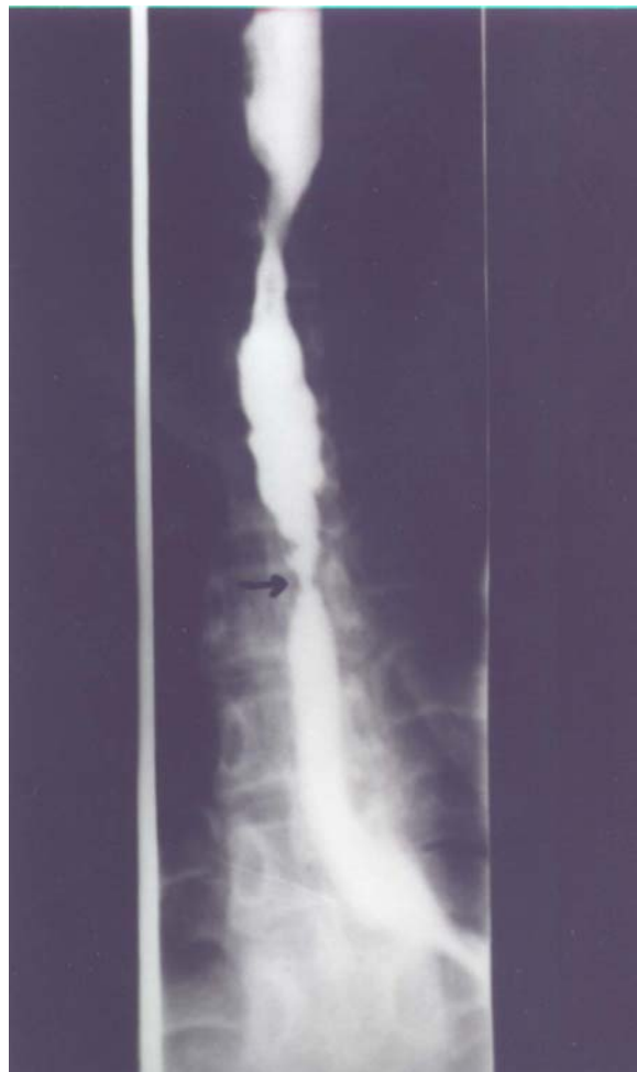
Figure 2. Barium study of the esophagus demonstrating stricture at the 25 th and 30 th cm of the esophagus.

Our patient had drunk on alkaline fluid the Fehling's solution. Defining the stricture and excessive esophageal ulcers in spite of admittance after 27 days of exposition to caustic material shows how serious effects alkaline solutions can lead to. Although alkaline solutions cause injury mostly in esophagus because of its neutralization with gastric acid, development of pyloric stenosis in the patient reveals the gastric influences as well.