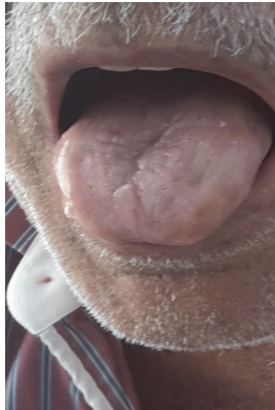
Figure 1. First patient with tongue pain did not have any signs of oral mucosal pathology.

mouth, unchanged with eating or drinking. He started feeling this pain after the first day of chemotherapy, and the pain lasted for three days. On physical examination, patient did not have mucositis or stomatitis (Figure 1). Serum vitamin B12 and folic acid levels were within normal limits. Serum zinc level was markedly low (47,94 L; reference range, 72,6-127). Anti-inflammatory therapy only mildly alleviated patient's symptoms. Tongue pain recurred on all 4 cycles of his chemotherapy regimen.