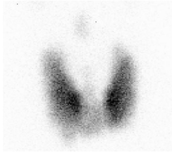
Figure 1. Thyroid scintigraphy, it was observed that the gland was hyperplastic and iodine uptake has been increased.