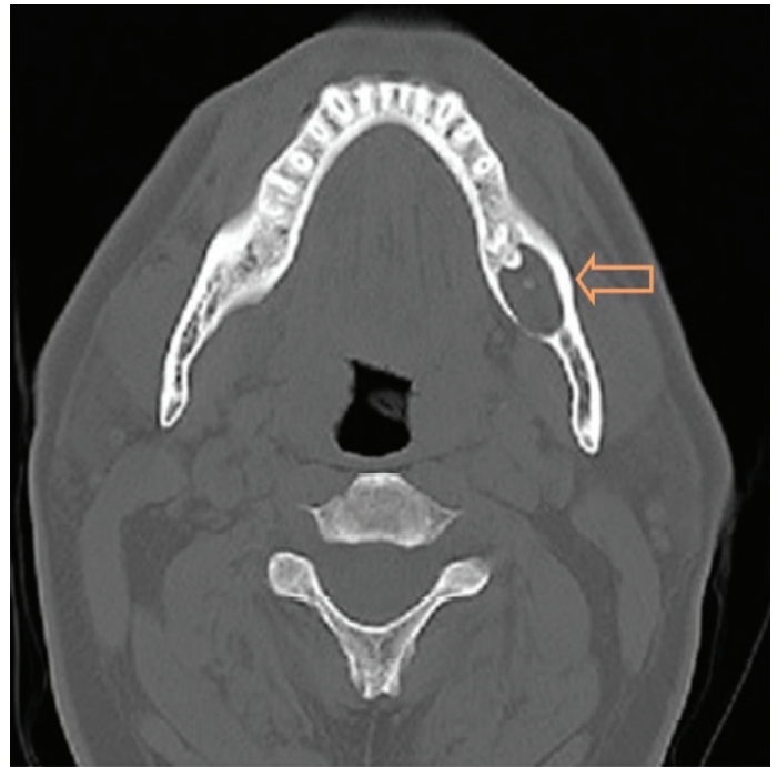
Figure 2. Preoperative CT image (arrow: buccal and lingual cortical plate)