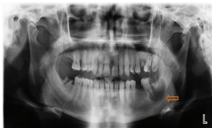
Figure 1. Preoperative panoramic image (arrow: compression on the nerve of the lesion)