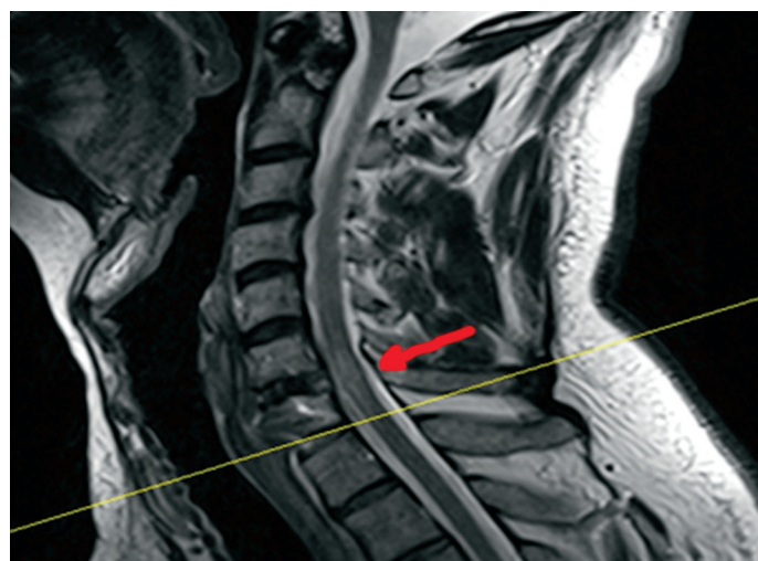
Figure 3. Sagittal T2W (A) images revealed an increase in signal and thickness in the spinal cord that was consistent with postoperative contusion at C 6 -7 disc level.

One patient presented to our clinic due to a C6-7 right sided protrusion, which led to right arm pain. The patient underwent a C6-7 micro discectomy and fusion. After the operation, there was a loss of strength and sensation on the patient's left side during the early postoperative period. The patient underwent an MRI scan, and a left-sided spinal cord contusion had developed at the operative level (Figure 3).