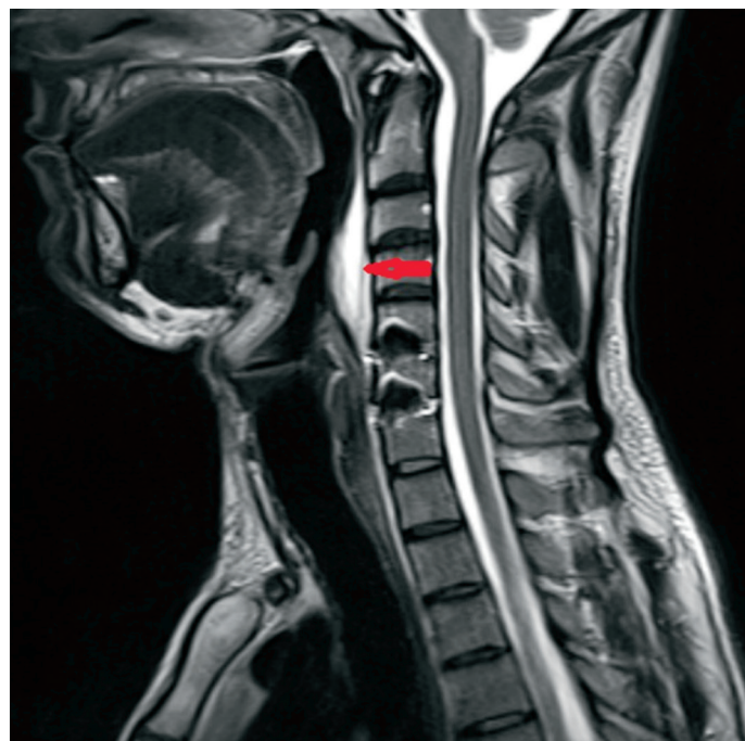
Figure 2. Sagittal T2W (A) images showed hyperintense soft tissue, consistent with retropharyngeal hematoma, narrowing the pharyngeal air column.

None of the patients in our series, including the patients who underwent cervical plaque revisions, had esophageal injuries.