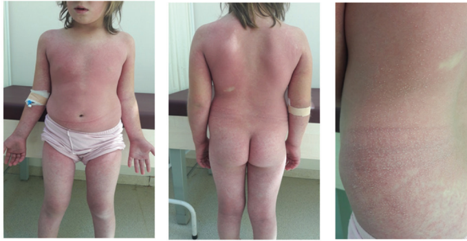
Figure 1. Widespread nonfollicular pustules on erythematous background