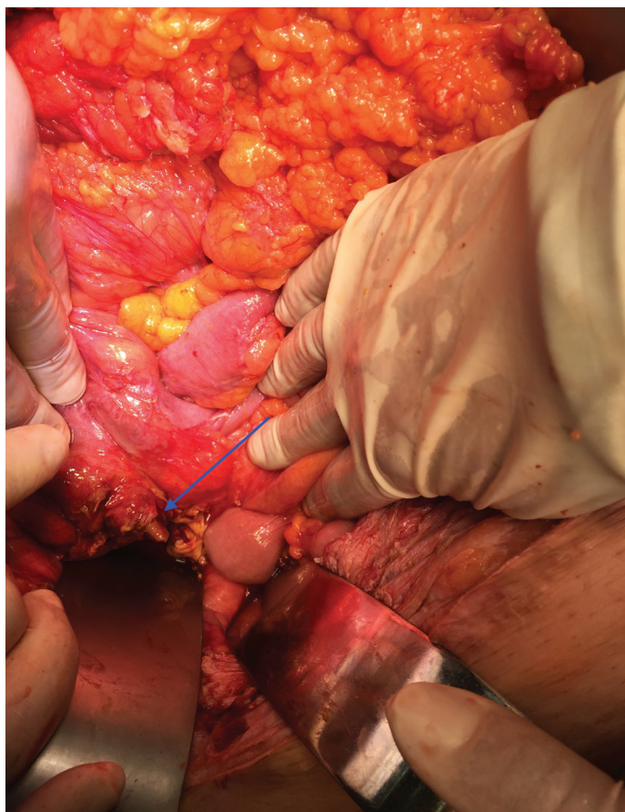
Figure 3. Intraoperative appearance of appendix body.

detected in dueodenum. When the cecum was deviated to the medial side, appendix could not be found due to necrosis; however, perforated retrocaecal appendix stump was observed (Figure 3).