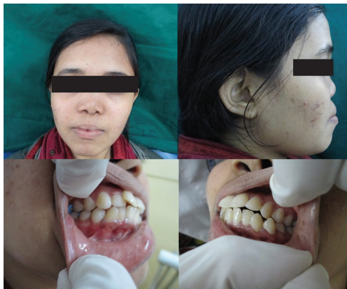
Figure 1. Photograph Showing The Extroral And Intraoral Features of Binder's Syndrome

Intraoral examination revealed flattening of the maxillary base, shortening of dental arch, decay in relation to 36,37, crossbite with respect to right and left mandibular canine and left mandibular premolar. There is also anterior open bite in relation to 31, 32, 33 and 34 and Angles Class I malocclusion (Figure 1).