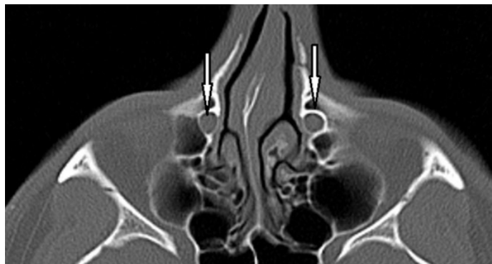
Figure 2. Bilateral NLD at the level of the orbital base in the axial plane PNS CT image

The patients with right-sided and left-sided NSD were included in different groups to analyze the relationship between the side of NSD and other parameters. SPSS 21.0 software (IBM Corp. New York, USA) was used for statistical analysis. Categorical data are expressed as